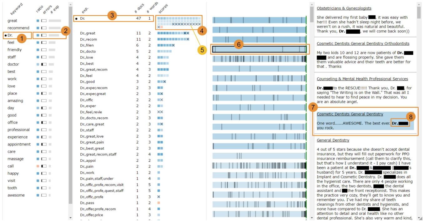
Figure 3: Showing the user interface of Rivelo. (1) is a selected feature and (2) are its relative indicators for average prediction, errors and frequency within the explanations set. Some of the features on this list are grayed out because they wouldn't return any explanation if added to the query. (3) is the selected explanation with the number of explained documents and the number of used features. (4) are the cells representing each explained instance, with color resembling the prediction value. Among them, (5) represent some false positive instances. (6) is the descriptor representing visually one of the explained instances. (7) is the raw data related to the same descriptor. (8) shows in bold how the explanation feature is used in the text data.

The feature list panel displays the features computed in the beginning and displays the following information in a list: the name of the feature, the ratio of positive labels, the number of errors and the number of explanations it belongs to. The ratio is displayed as a colored dot with shades that go from blue to red to depict ratios between 0% and 100% true outcomes. The number of errors and the number of explanations are depicted using horizontal bar charts. Users can sort the list according to three main parameters: (1) number of explanations , which enables them to focus on importance, that is, how many decisions the classifier actually makes using that feature. (2) ratio of positive labels , which enables them to focus on specific sets of decisions, and (3) number of errors , which enables them to focus on correctness, that is, what features and instances create most of the problems.